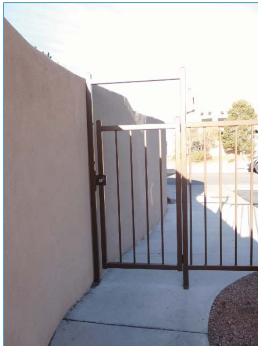
Pedestrian access gate