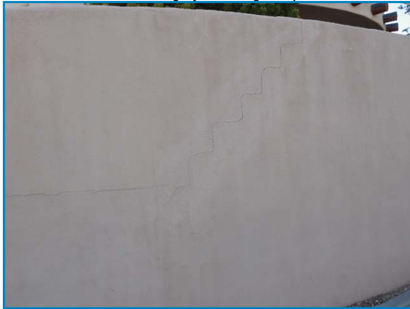
Stucco wall cracking