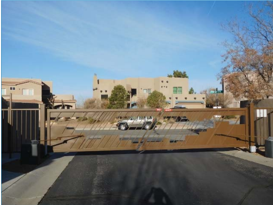
Vehicle access gates