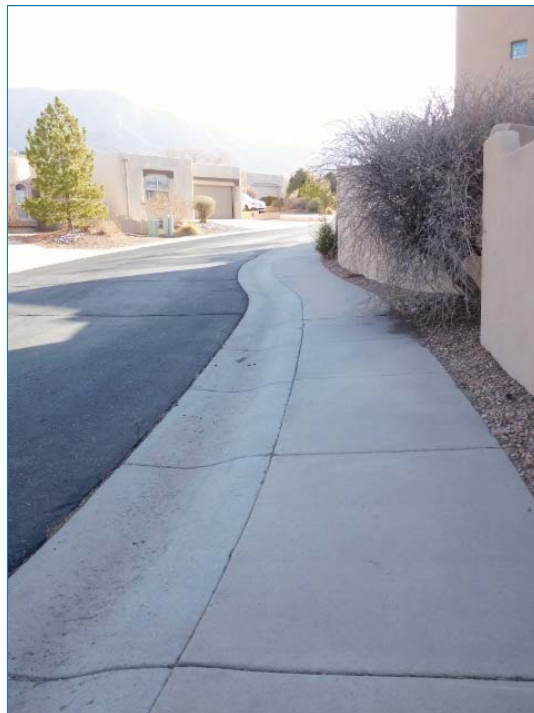
Typical concrete walkway