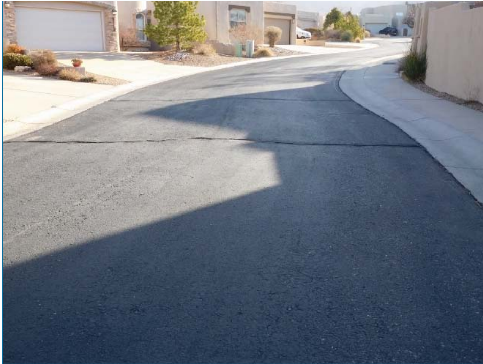
Typical street asphalt